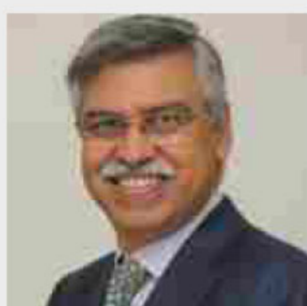
Mr. Sunil Kant Munjal

Chairman, Hero Corporate Service P Ltd. Member of the Executive Board, Indian School of Business