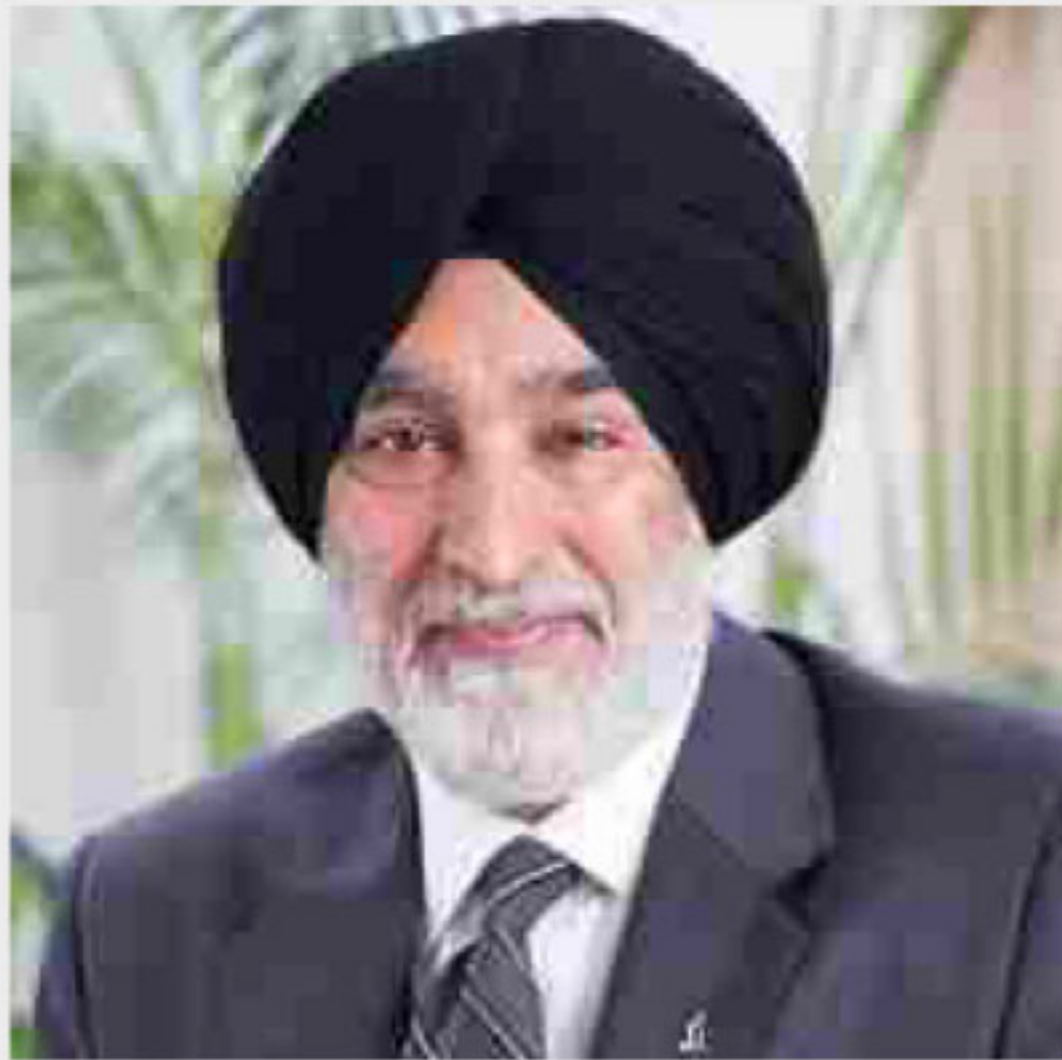
Mr. Analjit Singh

Founder & Chairman Emeritus, Max Group Member of the Executive Board, Indian School of Business