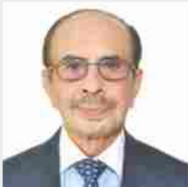
Mr. Adi B Godrej Chairman, Godrej Group Chairman of the Board, ISB